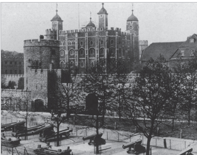
The Wharf c.1890. Heavy guns were placed here during the 1860s, at a time when fortifications were being erected at strategic location throughout the British Isles to guard against a possible French invasion. The tree planting relates to the arrangement of the guns and the area of open lawn to the rear has been taken up by a cafe.