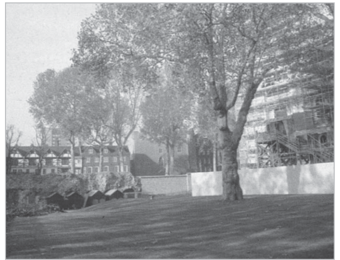
The same view in 1997 showing the maturing London Plane trees and the removal of the path layout and associated planting.