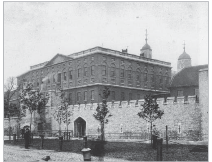
A photograph dated c.1822 showing tree planting along the Wharf with the former Ordnance office rising above the river defences in the background.