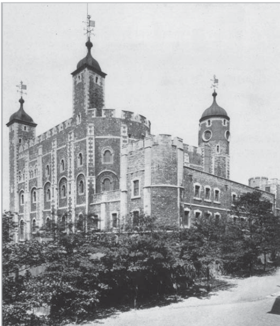
A solid line of trees east of the annex to the White Tower shortly before its demolition in 1879.