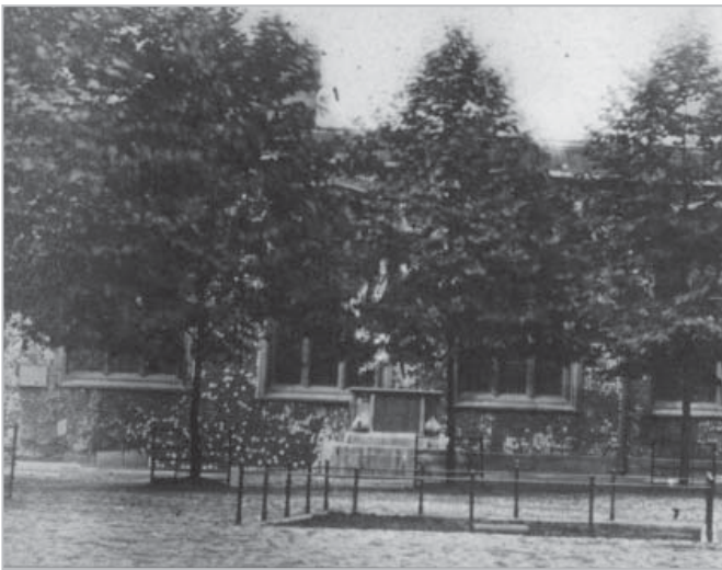
Trees to the rear of the Scaffold Site - c.1870.