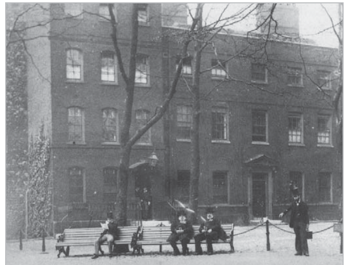
A photograph of c.1880 on Tower Green showing a number of London Plane trees.