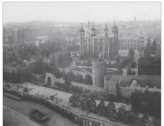
A view from Tower Bridge from 1898.