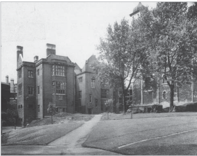
A view of the south lawn in 1940 with the Main Guard in the background. The path arrangement is as recorded on the 1893 OS map (Figure 3.8)