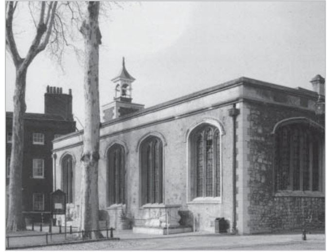
The Chapel c.1970's showing that one of the trees has been removed and the others have been subject to crown lifting and reduction.