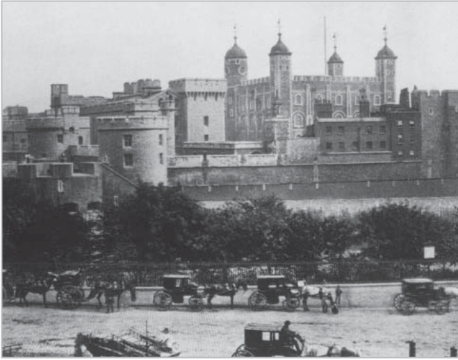
The Tower viewed from Tower Hill, c.1880.