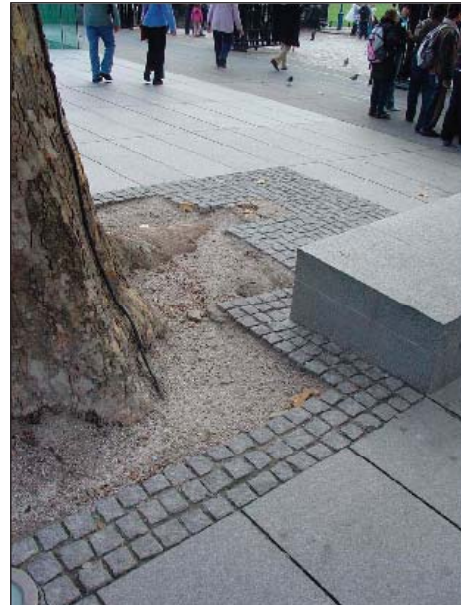
Photograph 7 Surface treatment around the base of T100