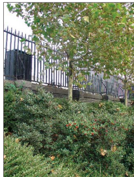
Photograph 9 Showing proximity of new planting on the Moat Banks to the perimeter wall and railings