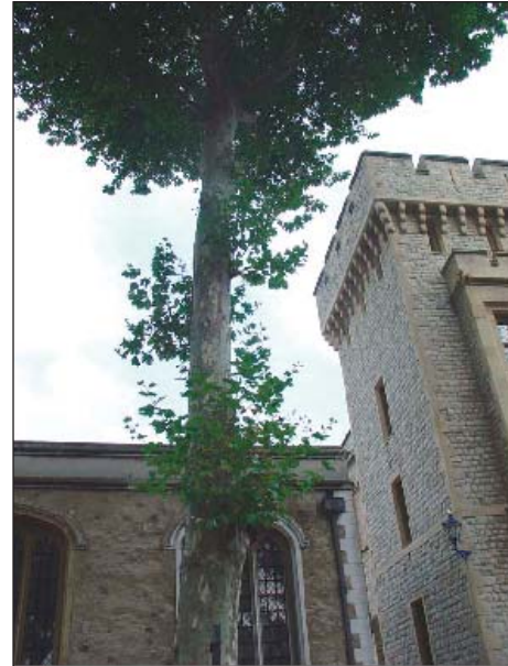
Photograph 2 Epicormic growth on T138