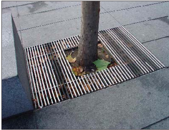
Photograph 6 Planting pit with metal grill around one of the trees in the new entrance/information area – Trees 22 to 26