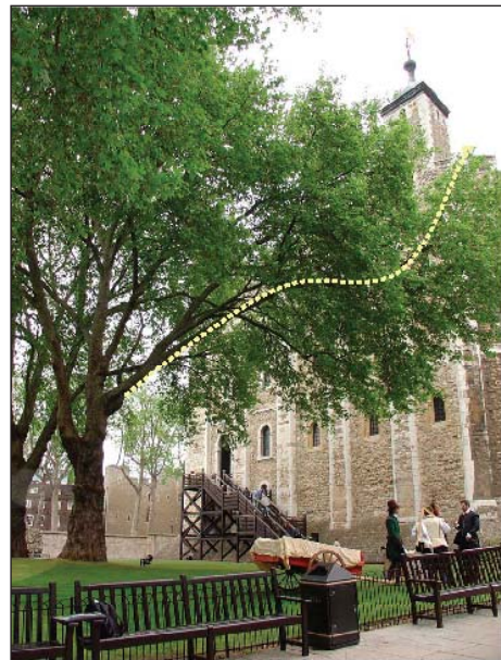
Photograph 4 End-loaded limb on T132 – yellow dashed line