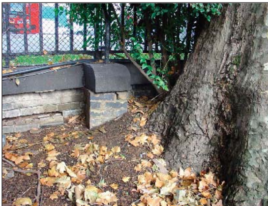
Photograph 8 T153 causing direct damage to the adjacent wall