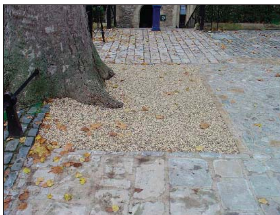
Photograph 5 Resin-bonded gravel at the base of T141